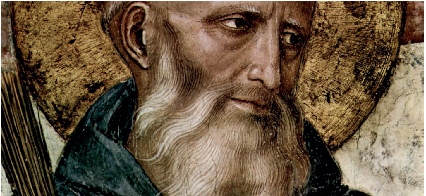
St. Benedict from Crucifixion With Saints, by Fra Angelico

10 Washburn Way, Scarborough, ON, M1B1H3 | Tel: 416-298-0989 | Fax: 416-298-8959 Email: StBarnabasSC@archtoronto.org | Website: https://stbarnabasto.ca | Social Media: @stbarnabasto